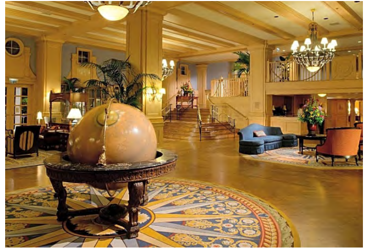
Exhibit Space Fees